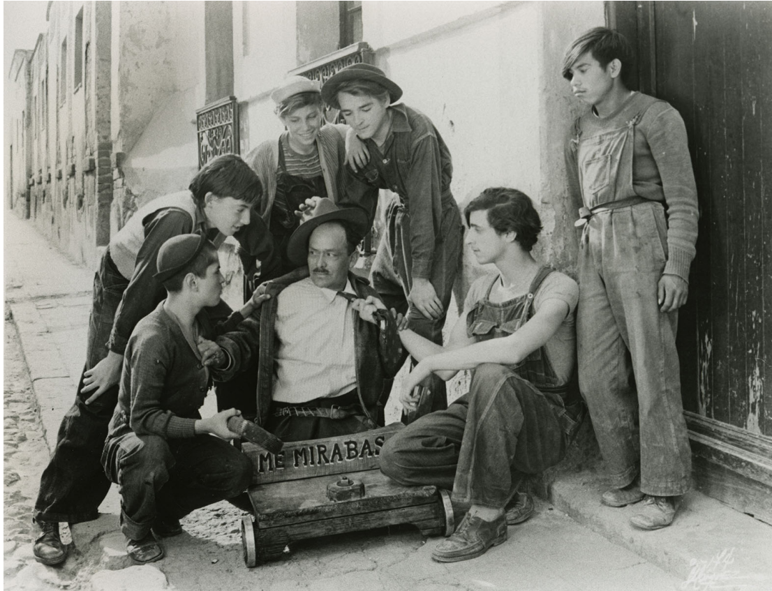
Robbery of the legless man.