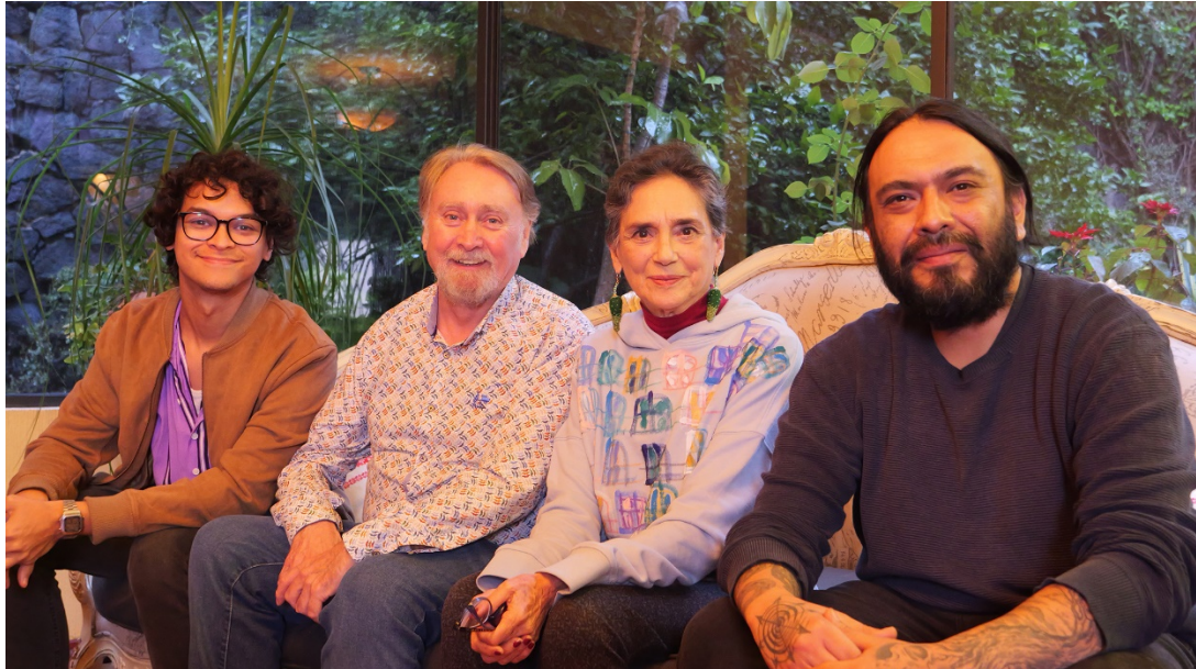
Photo after the interview with Ofelia Medina in CDMX.