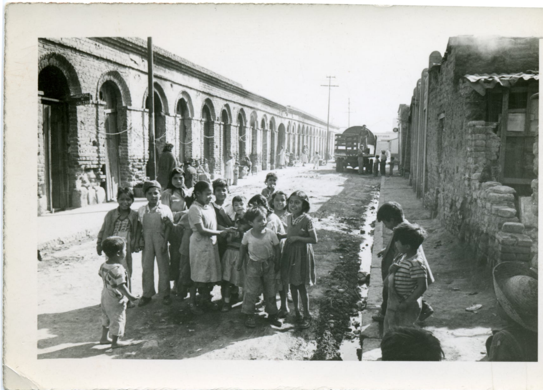
Photo taken by Buñuel locating exteriors in Nonoalco , CDMX.